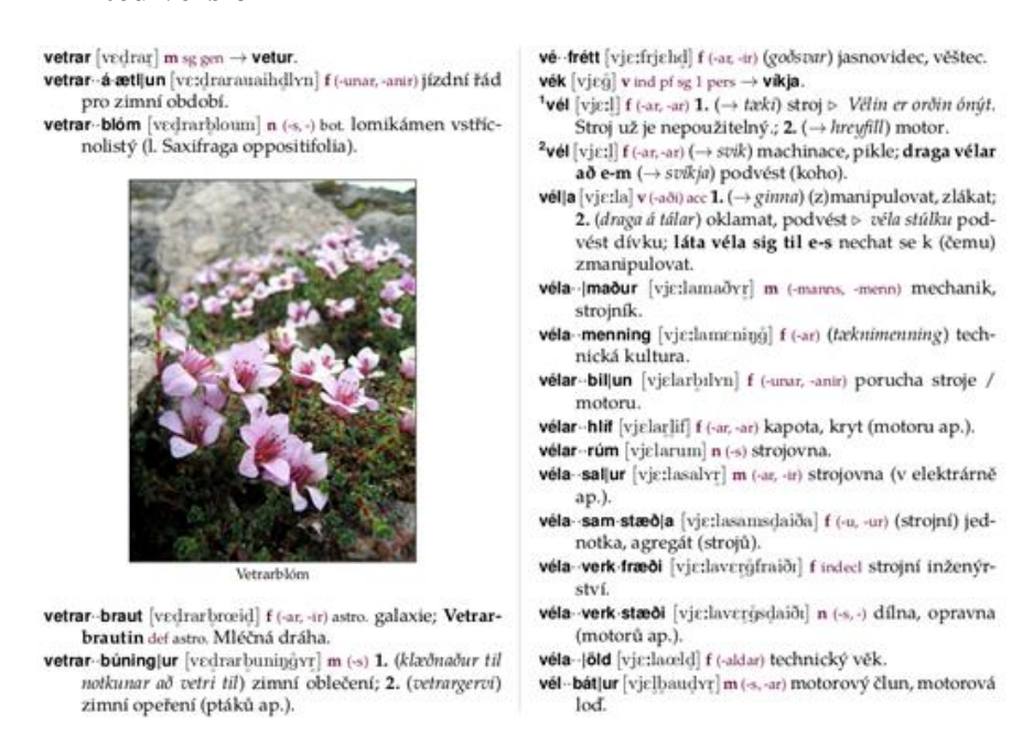
Fig. 1: Printed version sample